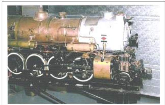
The late Vaughan Cherry of England next to his Berkshire